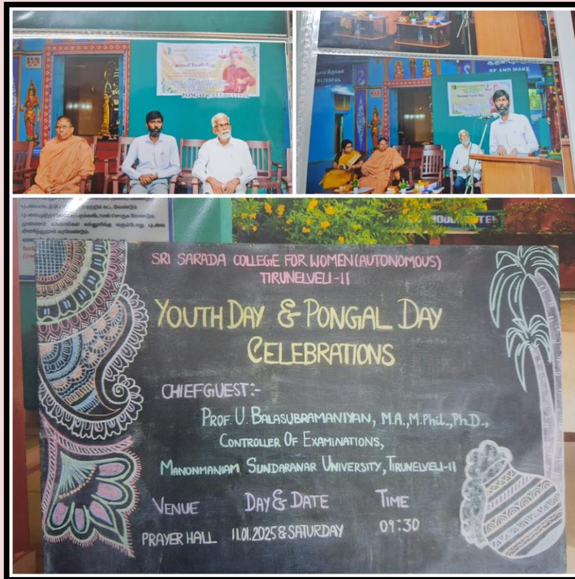
Youth Day on 11.01.2025

The college organized Youth Day to promote regional diversity and cultural harmony. Echoing the spirit of national unity, the event embraced the vision of a nation where all citizens, irrespective of their regional affiliations, work together for common goals to promote regional harmony.