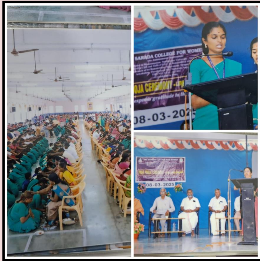
Pada Pooja on 08.03.2025

The college organize Pada Pooja ceremony symbolizes reverence and gratitude, fostering cultural harmony by uniting diverse traditions in a shared expression of respect.