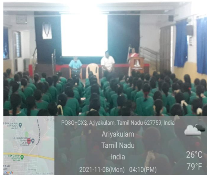
Professional Skill development for Competitive Examination