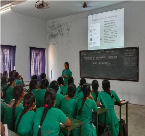
Student Seminar – Participative Learning