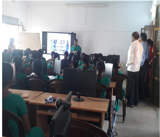
Student Seminar – Participative Learning